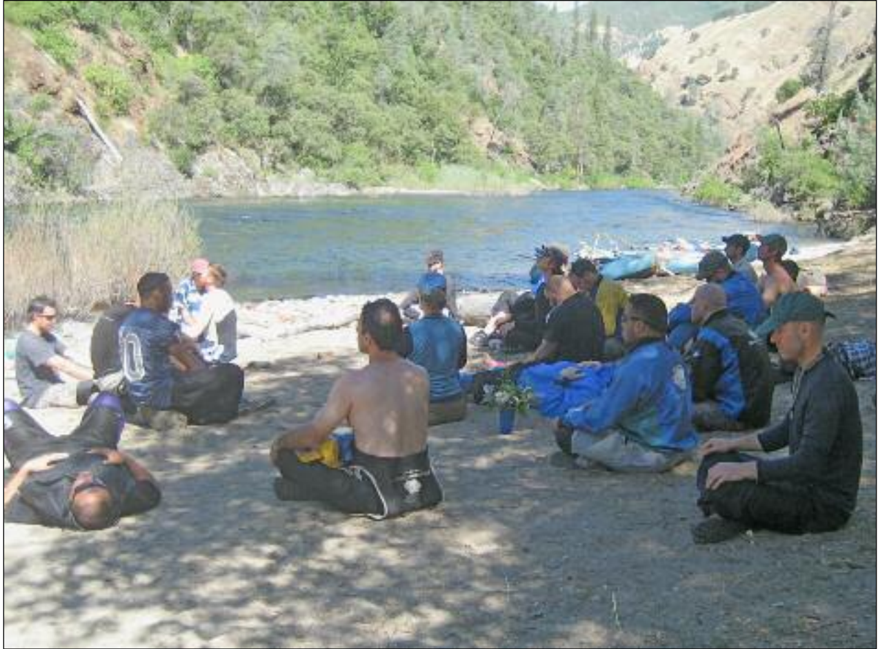
Becoming more in touch with with what is present.

The program's goal is to apply these powerful tools through activities that are meaningful and relevant to veterans. These tools assist in healing and well-being through: